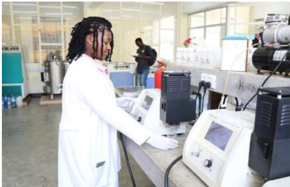
Civil engineering student in a practical session in Water Quality Laboratory