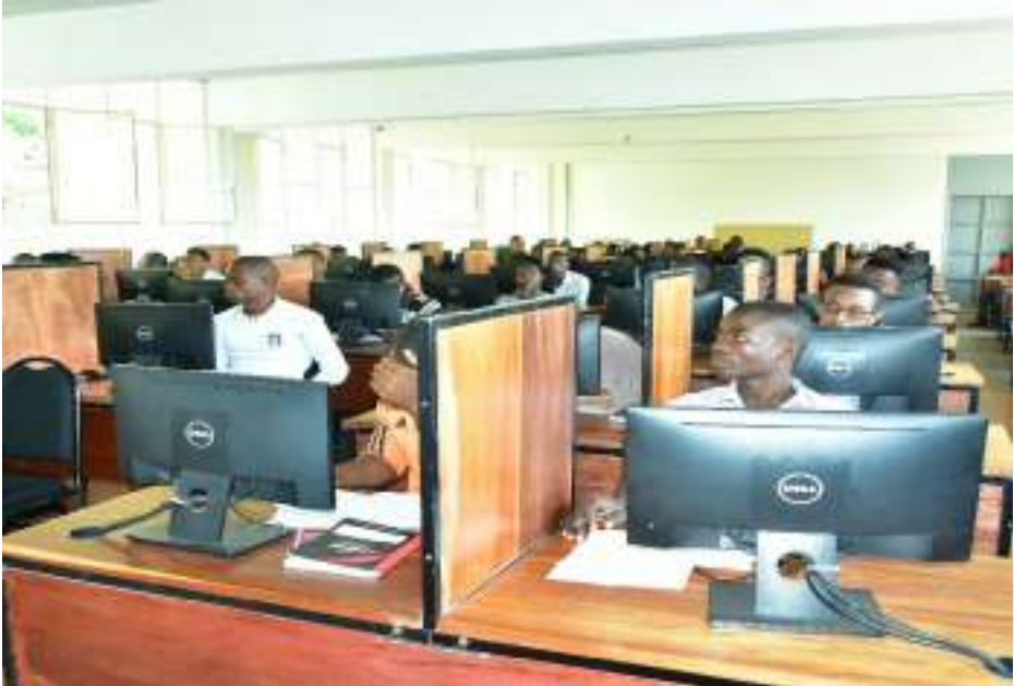
Students in class session at Information and Communication Technology Laboratory

related modules, such as basic computer application, computer programming and networking.