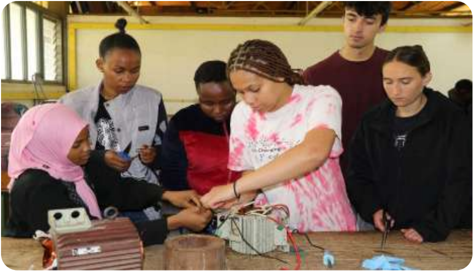
Electrical engineering students in the class session of motor rewinding

iii. Serving the communities to which we belong, at local, national, and international levels, with a deep awareness of our ethical responsibilities to our profession and to society.