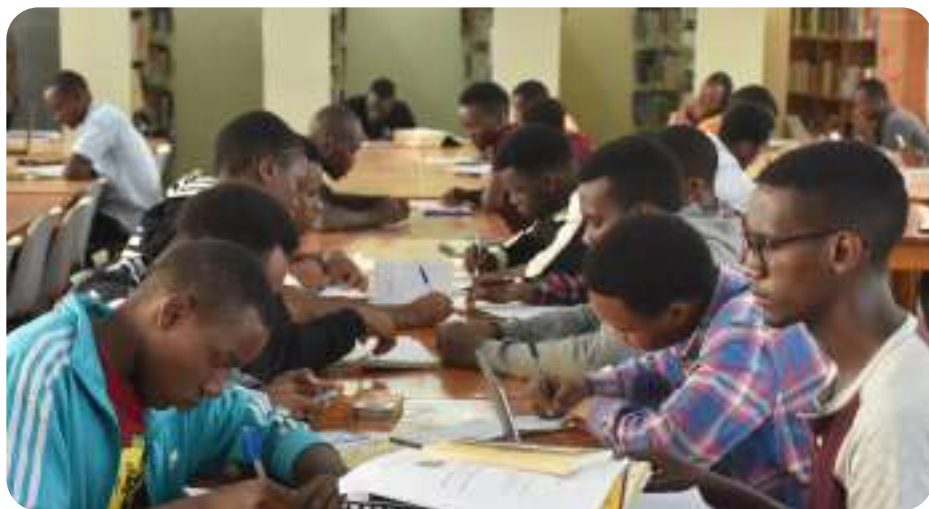
Students in ATC Library

The library and study centre offers facilities for studying, preparation for assignments, test, examinations and research. These services include books in all technical fields, magazines, newspapers, newsletters and journals