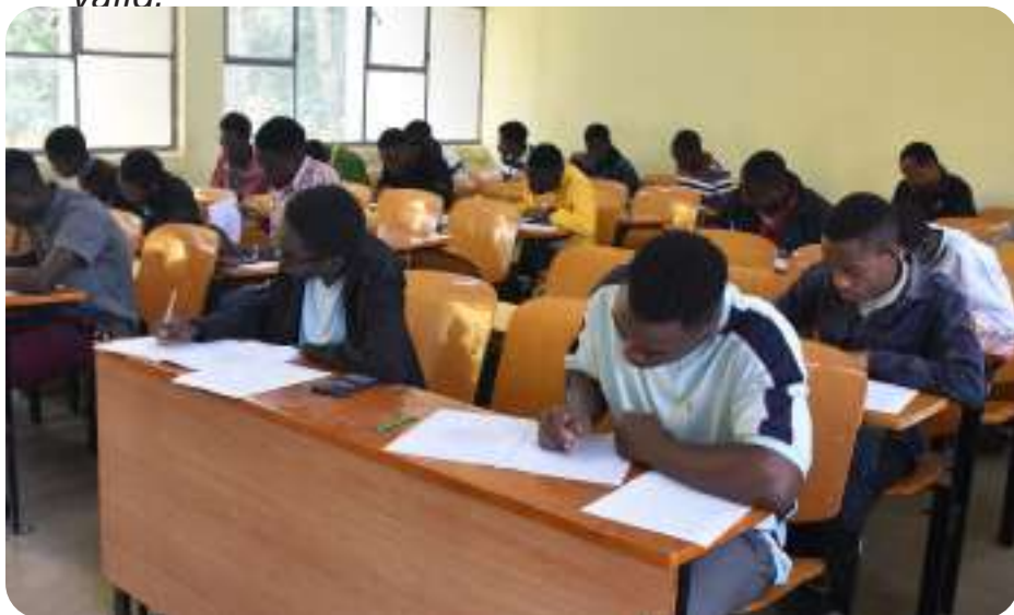
Students in examination session

(b) Notwithstanding the revocation of the College Examination Regulations, of August 2020, anything that was done under the said regulations shall remain valid.